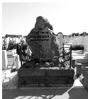
1. Commemorating the Jews of Ostrów Mazowiecka, Holon cemetery (Tel Aviv), photo dated 27 September 2019. The stone bears the inscription in Hebrew: “In memory of the martyrs of the Ostrów Mazowiecka community who were murdered in the Shoah” (translated by the Pilecki Institute).