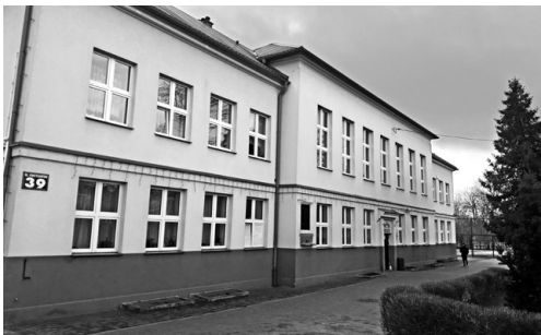
10. The former "Browar" in Ostrów – presently the Tadeusz Kościuszko Primary School No. 1 in Ostrów Mazowiecka. Photo dated 3 February 2020