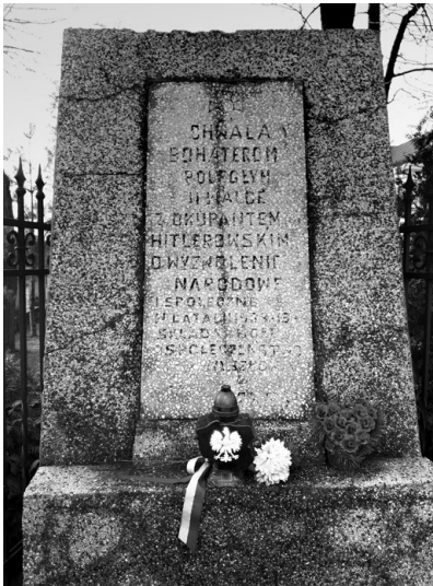
8. Plaque commemorating the victims of the German terror apparatus in Wyszaków, located near the former Gestapo headquarters, the so-called Willa Cudnego