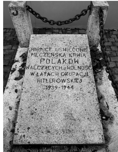
9. Plaque commemorating the Ostrów victims at the Tadeusz Kościuszko Primary School No. 1 in Ostrów Mazowiecka. Photo dated 3 February 2020