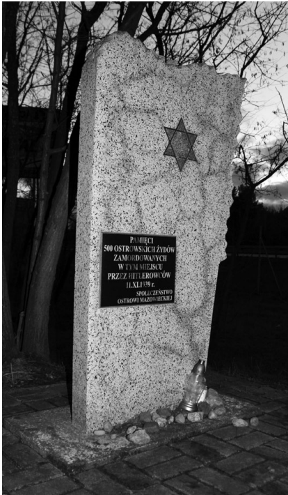
5. Commemoration of Ostrów’s Jews, unveiled on 18 April 1983. Photo dated 3 February 2020.

The inscription reads “In memory of the 500 Ostrów Jews who were murdered here by the Nazis on 11 November 1939. Residents of Ostrów Mazowiecka.”