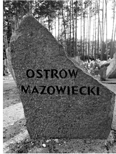
4. Commemoration of Jews from Ostrów Mazowiecka at a site of memory in Treblinka, photo dated 25 May 2020.